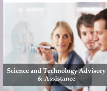
Science and Technology Advisory & Assistance