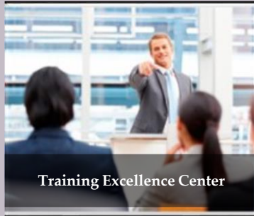
Training Excellence Center