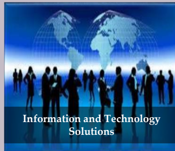
Information and Technology Solutions