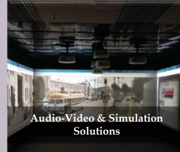
Audio-Video & Simulation Solutions