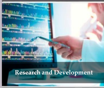
Research and Development